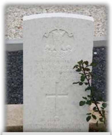
HIS DUTY DONE