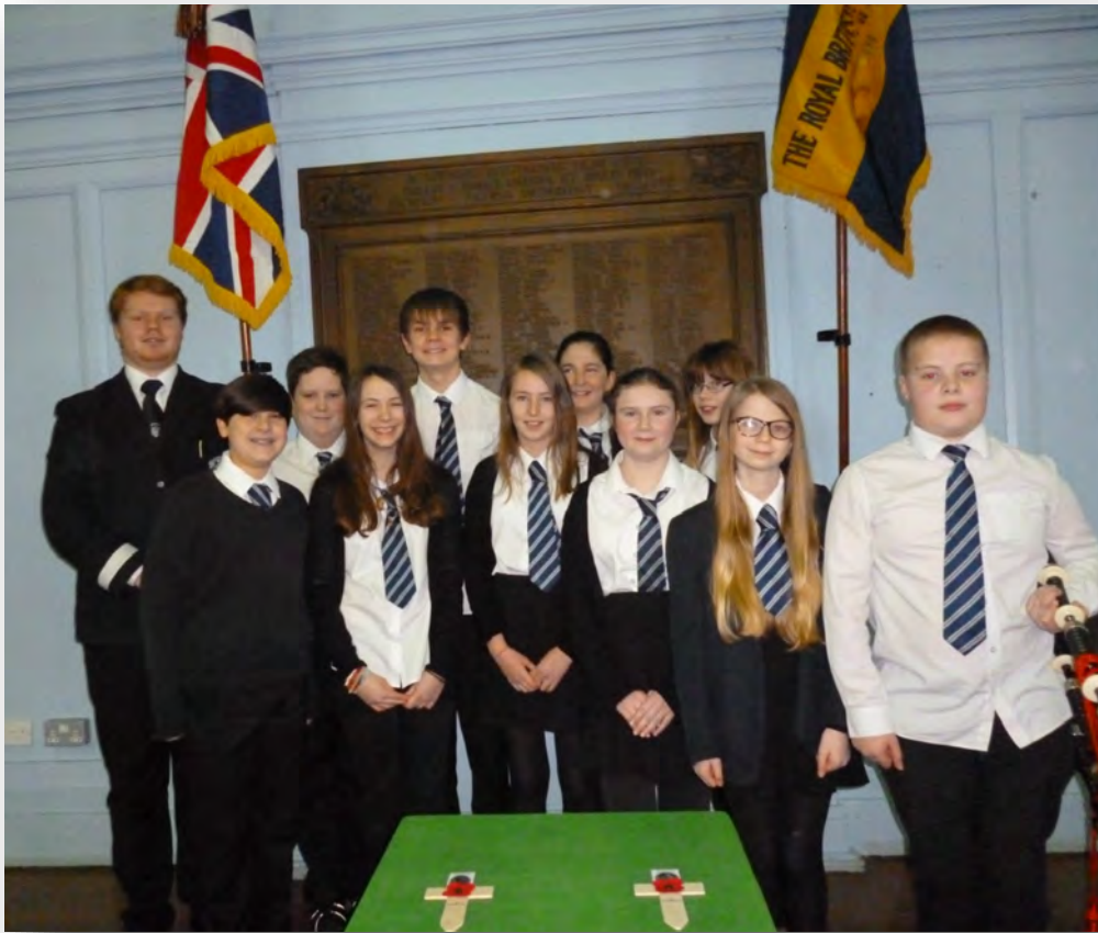
“FLOWERS OF THE FOREST” GROUP AT THE FIRST REMEMBRANCE SERVICE, MARCH 2015